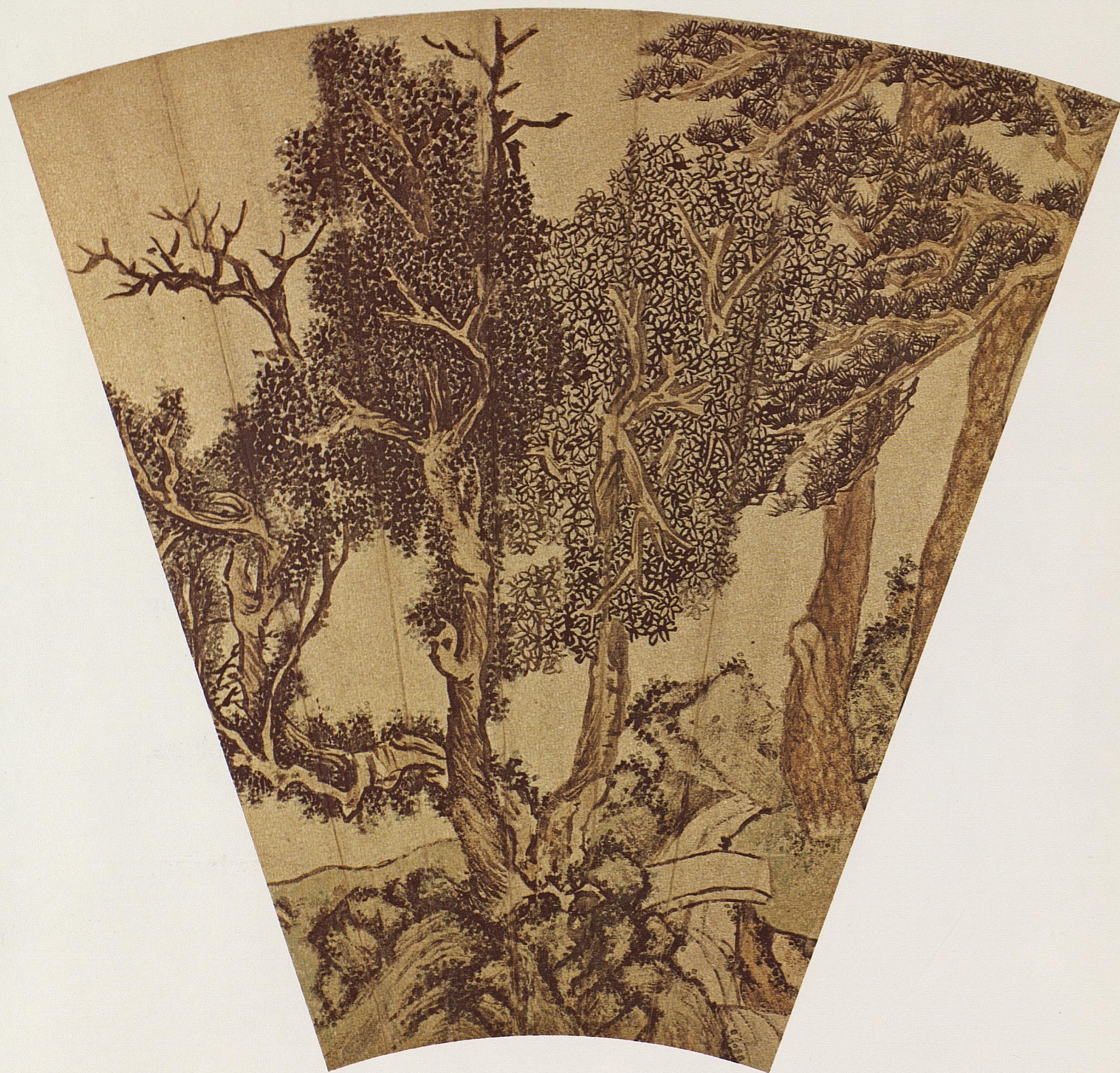
Scholar Fishing (no. XXXII), detail