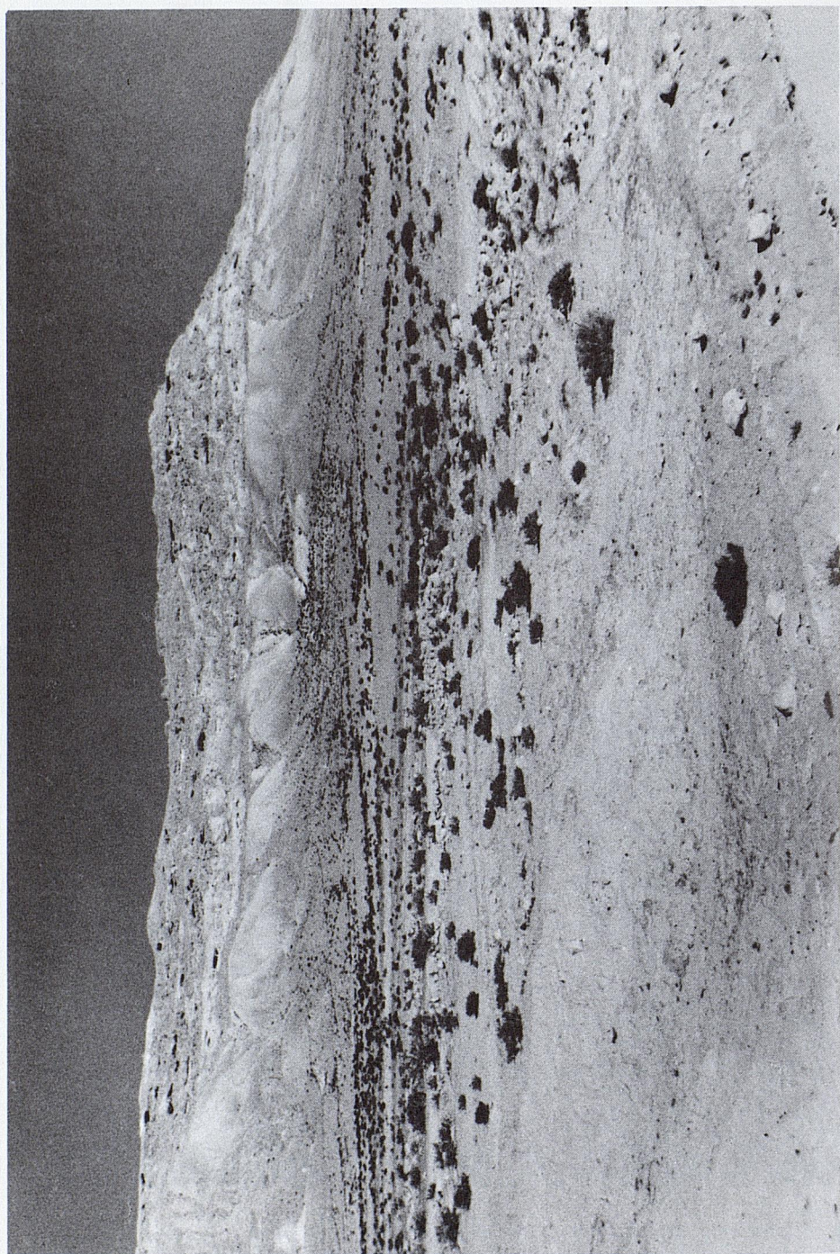
FIG. 44. Nabataean-Byzantine hill city of Abdah in the Negev (see pages 271-275).