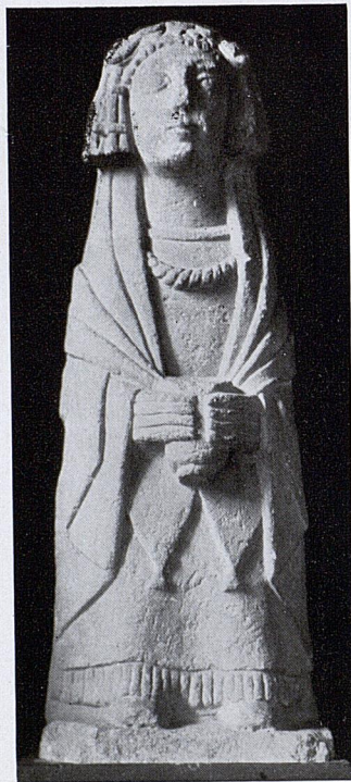
a. Iberian stone statues, from the Cerro de los Santos