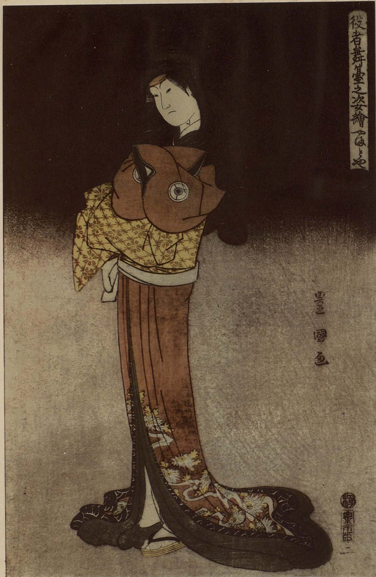
UTAGAWA TOYOKUNI: Iwai Hanshirō in a feminine rôle. About 1794