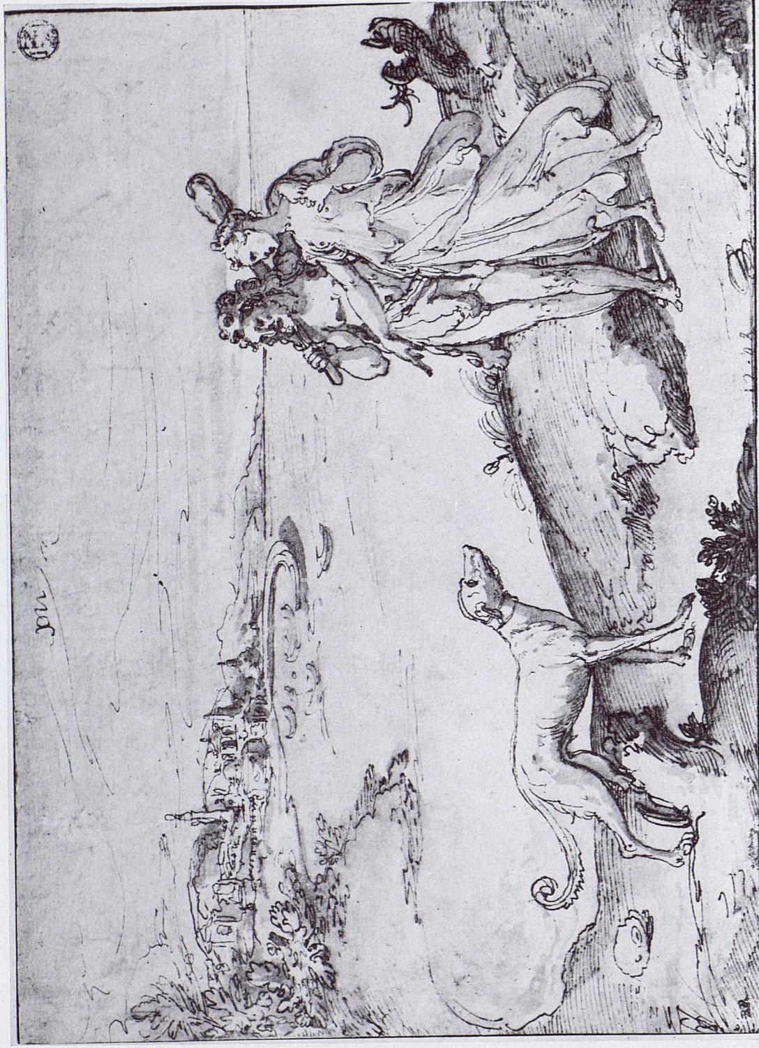
134 (cat. 192). Hercules and Iole finding the Murex Louvre