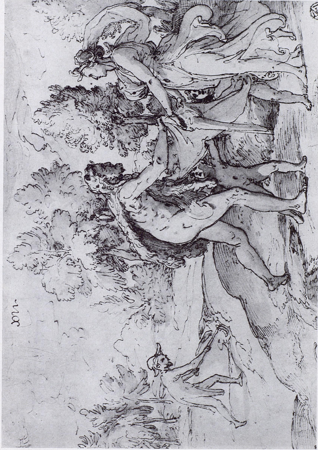
135 (cat. 193). Hercules giving Iole a Garment dyed with Murex Louvre