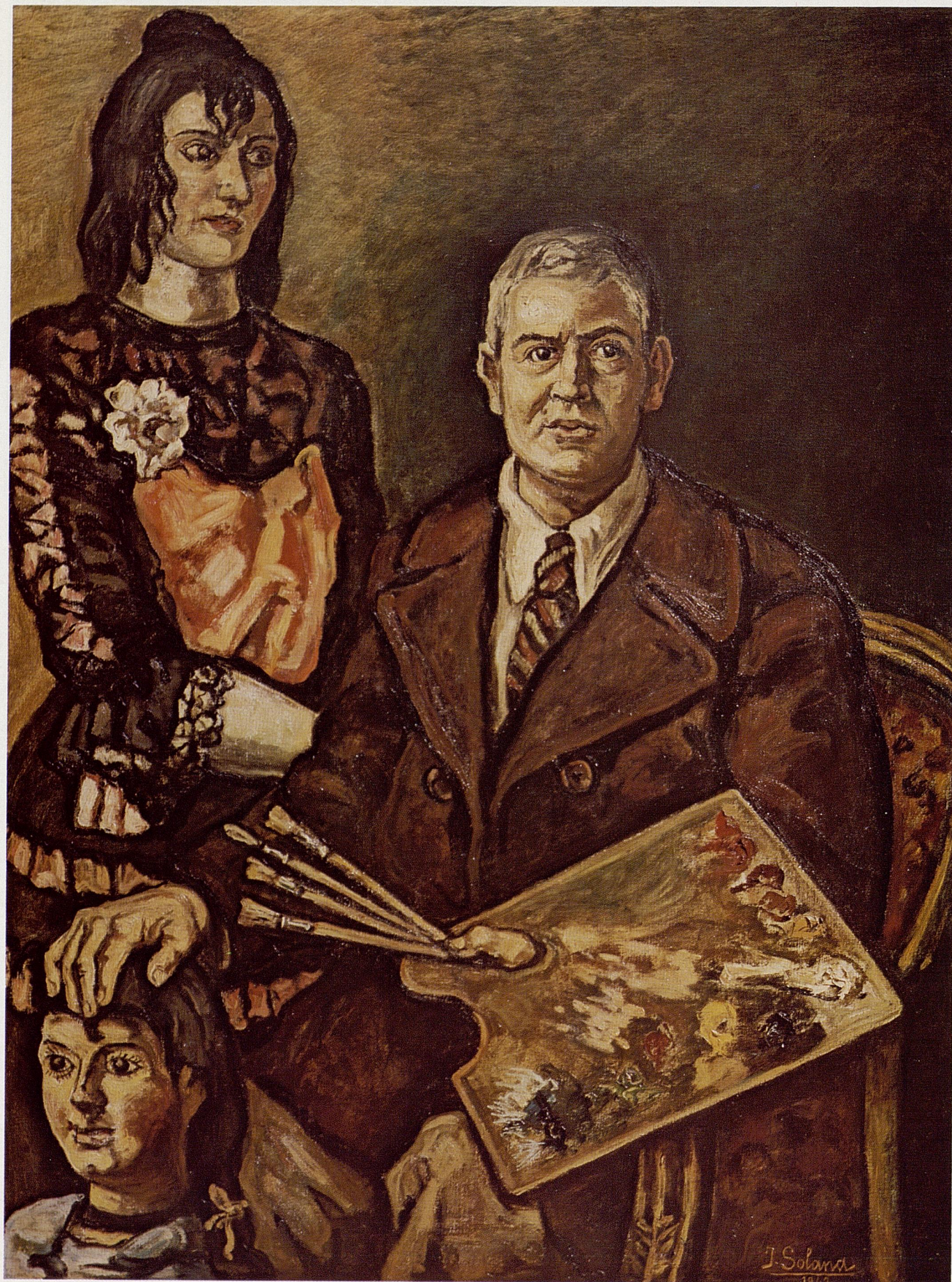
Plate XIV (Fig. 253) Self-portrait . 1943. 53½ x 40½. Collection Emilio Botín Sanz de Santuioia y López, Santander.