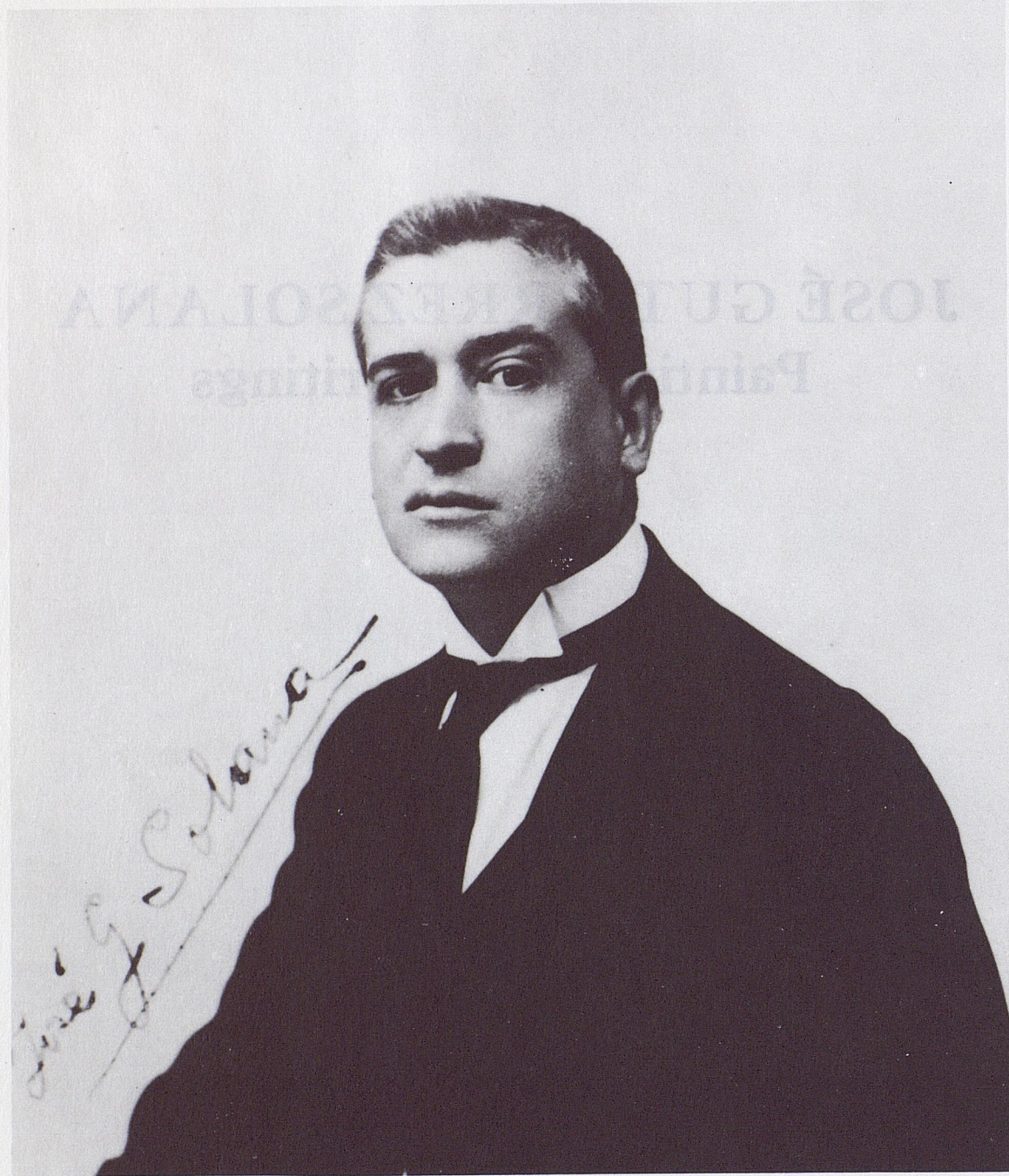
José Gutiérrez Solana (1886-1945)