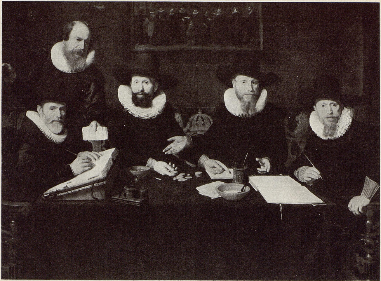
125. NICOLAES ELIAS. REGENTS OF THE "SPINHUIS." 162[8]. Amsterdam, Rijksmuseum. Oil on canvas (178:233).