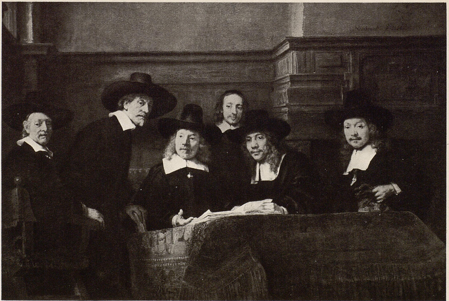
126. THE BOARD OF THE DRAPER'S GUILD ("THE SYNDICS"). 1662. Amsterdam, Rijksmuseum. Oil on canvas (185:274).