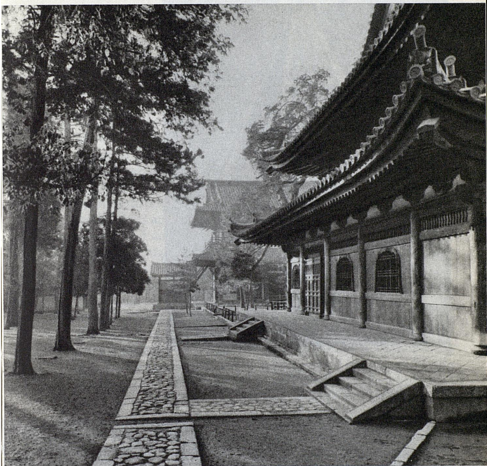
24. "Daitoku-ji is a classic example of a Zen sect monastery. Its gates and halls still follow the Chinese canons of arrangement and design. . . ." Daitoku-ji's Butsu-den.