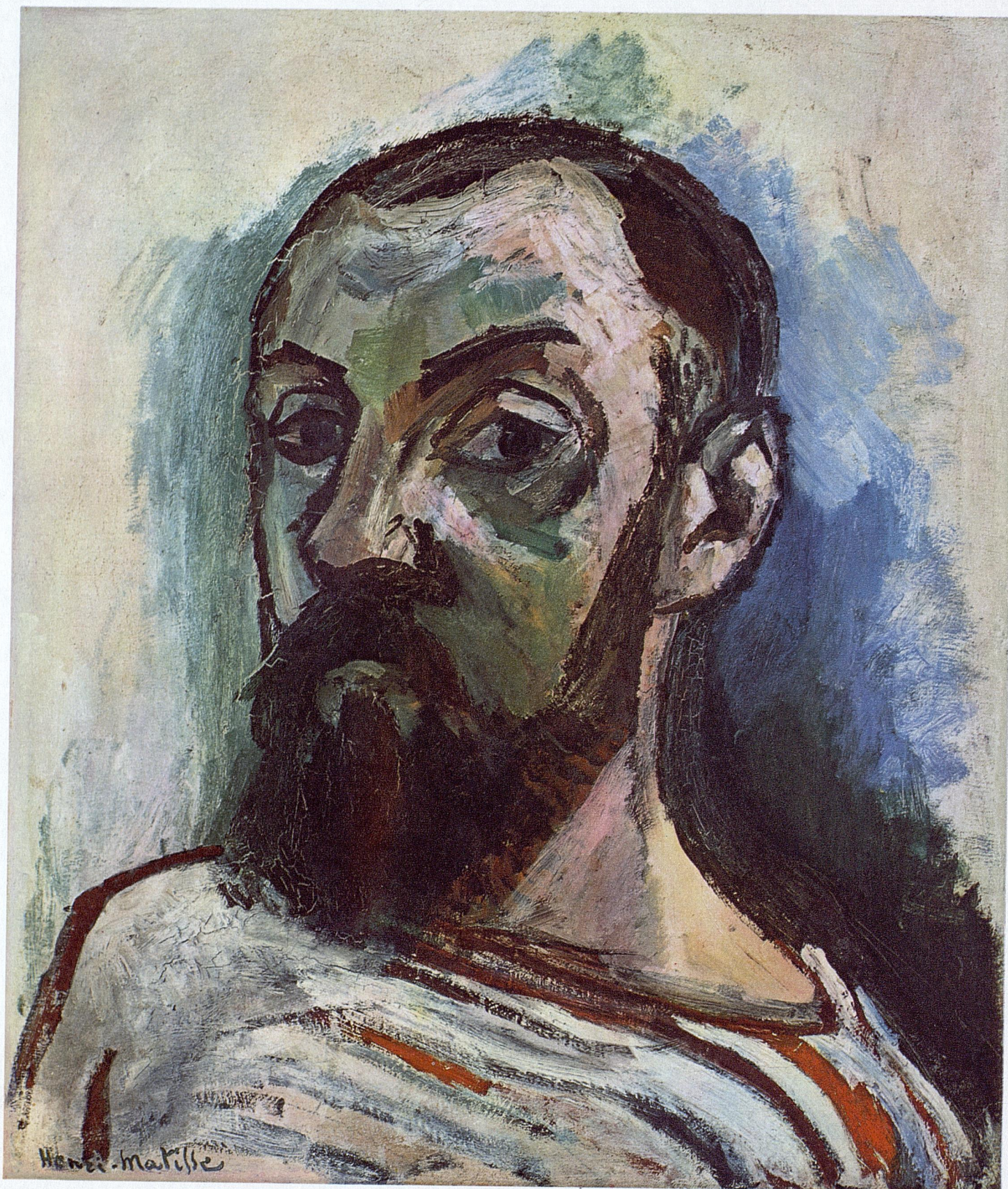
But man is our subject . . . I. - Henri Matisse, Self-portrait (1906).