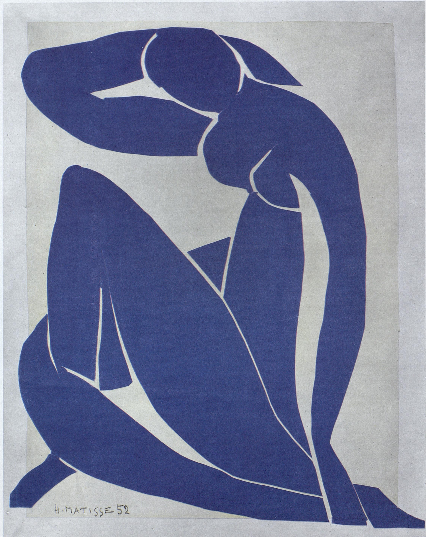
I. — Seated Blue Nude , cut-out gouache, 1952. Reproduced for the first time from the original and not from the lithograph.