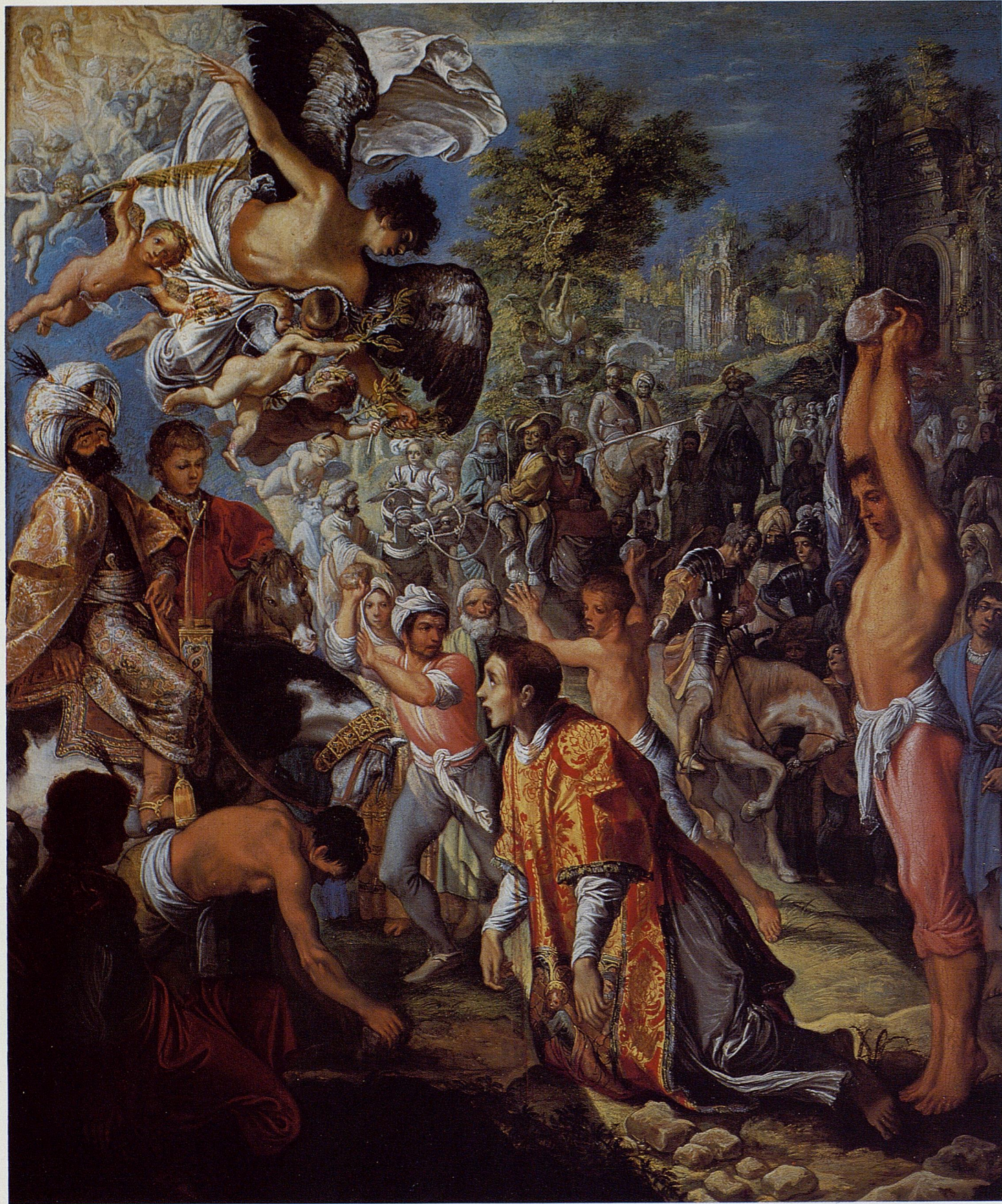
1 The Stoning of St. Stephen (Cat. 15). Edinburgh, National Gallery of Scotland