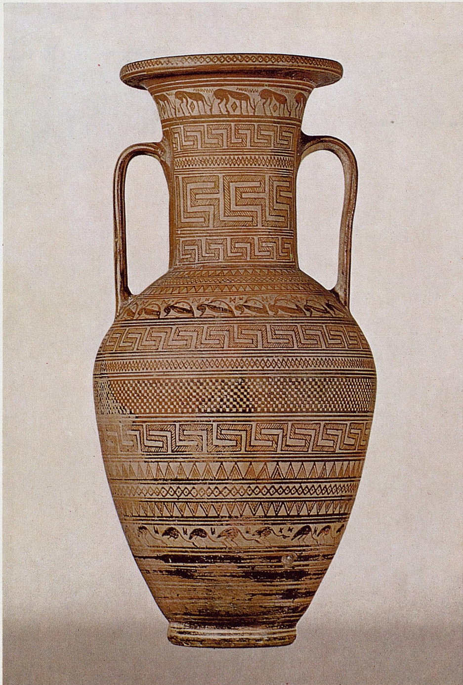
1 Athenian Geometric amphora with encircling bands of Geometric patterns interrupted by rows of grazing deer, recumbent goats and geese. c. 750 B.C. Height 16½ ins