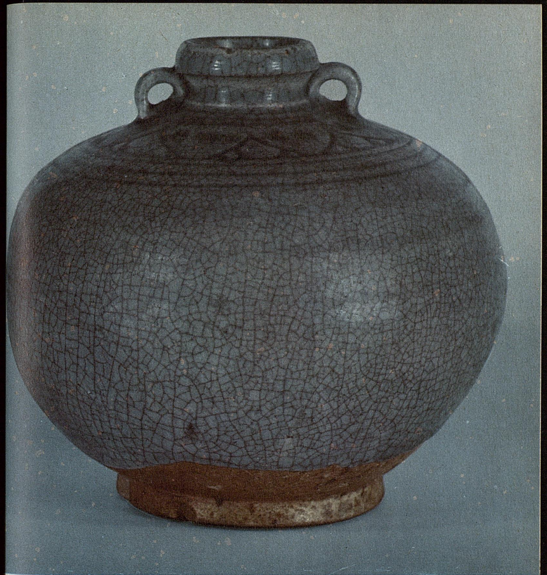
135 Porcelain jar from Sawankhalok. The form and texture of this Siamese pot match the beauty of the Chinese ware it imitates